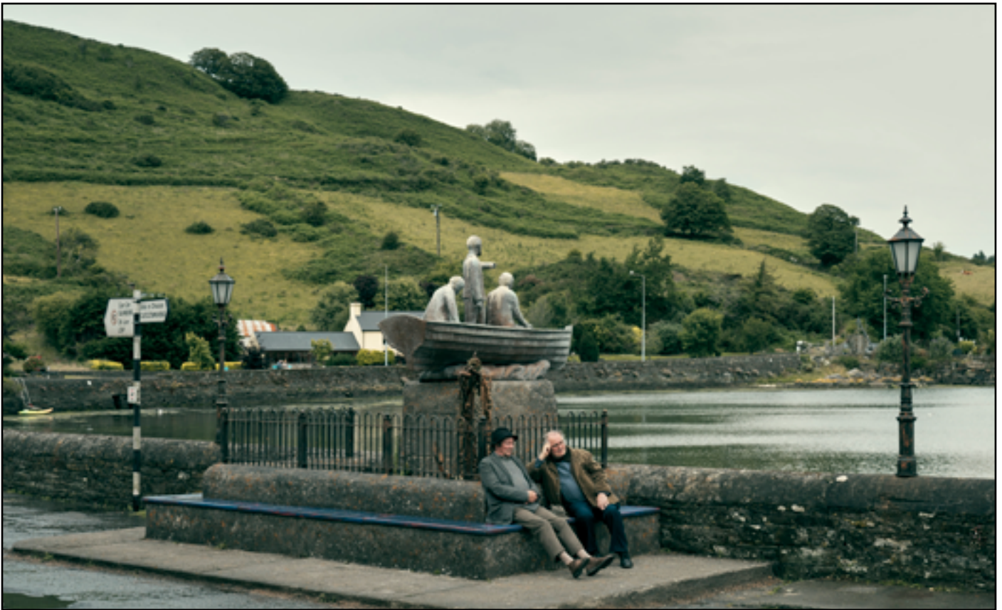
Bodkin shooting locations, above, Union Hall in Cork, below left and right, Howth Castle in Dublin, bottom left, Dave's Diner in Julianstown, County Meath, and bottom right, Glandore, County Cork.