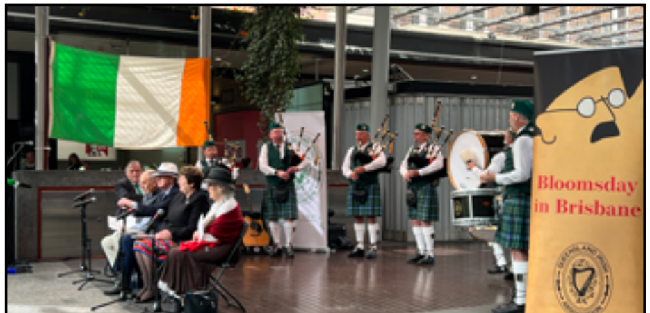
Queensland Irish Association's celebration of Bloomsday in 2023.

and members of Queensland Irish Association Pipe Band will be there to entertain you. June 16th falls on a Sunday this year, a perfect day to head into the city and spend time enjoying some Irish culture on Queen Street Mall. Be there at 11.30am for a 12 midday start. After the event, pipers will lead you to Gilhooley's, where we will have a drinks and lunch gathering.