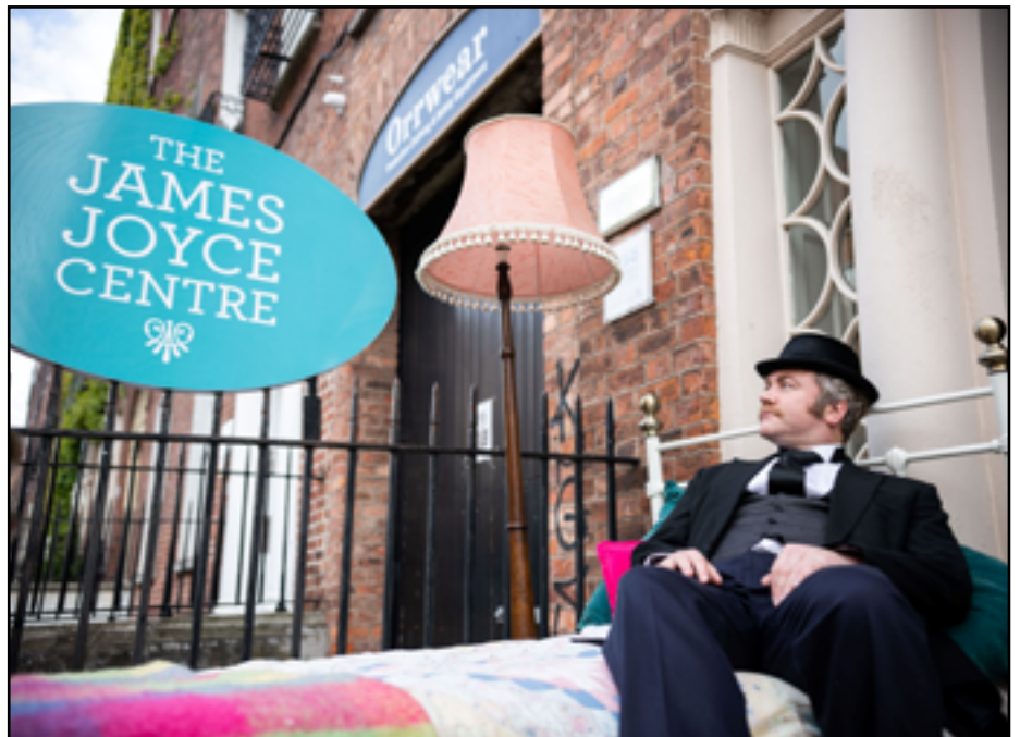
Bloomsday at The James Joyce Centre, Dublin. Top right: Sweny's Pharmacy, Dublin and, top left, a portrait of James Joyce.

the novel and dating from 1847, will welcome people to enjoy a cup of tea, buy a bar of lemony soap, as Bloom did, and get involved in a reading.