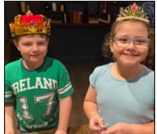
Australian Historical Dance provided music, and dancing demonstrations, at our Bealtaine celebration.