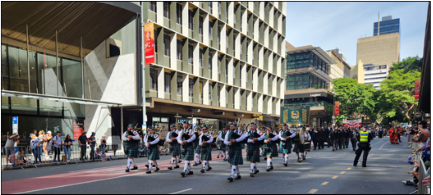
Queensland Irish Association Pipe Band proudly taking part in the Anzac Day march in Brisbane. Well done all!