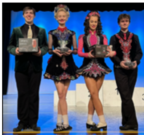
Congratulations to QIA Dancers, who had both solo and team debuts at the 2024 May Feis. Some of the younger dancers were taking part in team dancing for the very first time! Not only did the dancers do the legacy of Irish dancing in Queensland proud, but they took home two May Feis titles to boot!