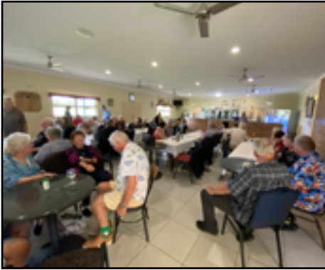
Packed house at the Gaelic Games clubhouse in Willawong for the Irish community lunch in May. The next lunch will be Christmas in July.