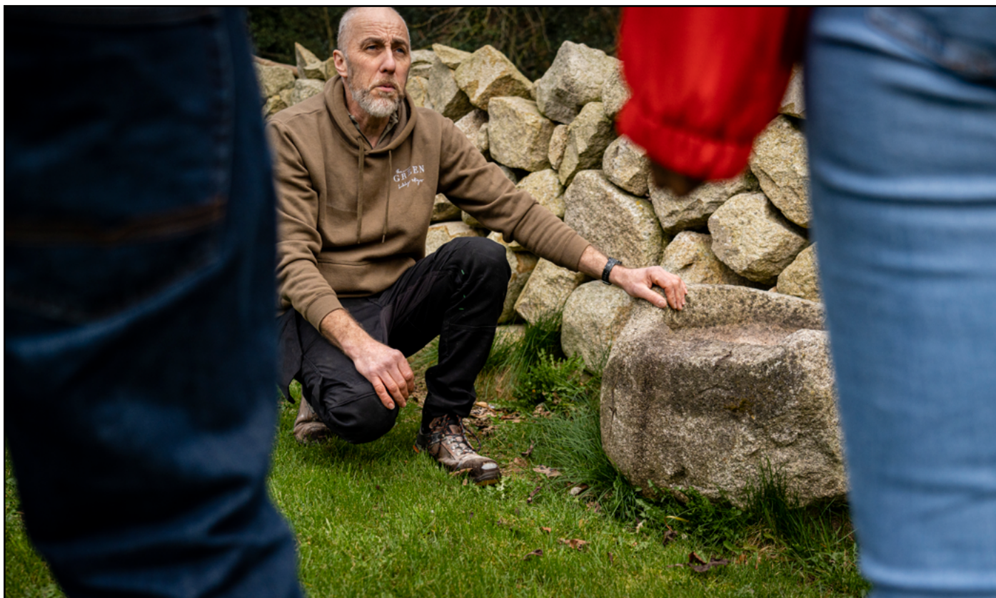
Dry Stone Wall Building Experience, The Mournes,