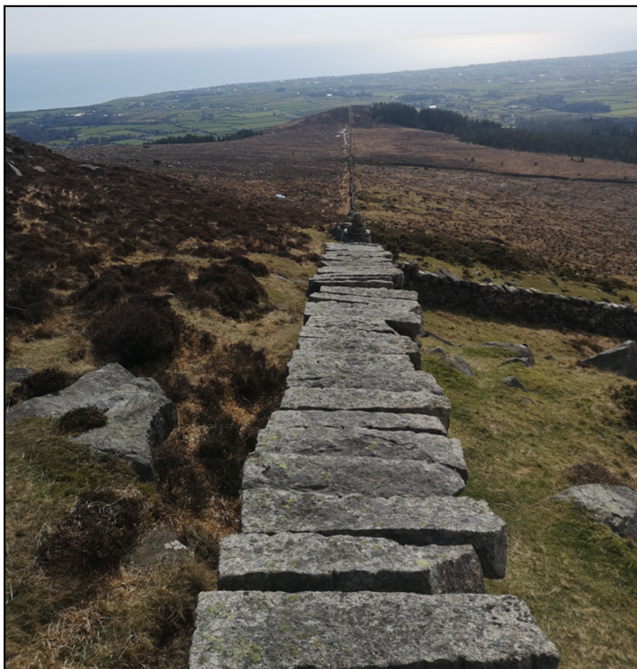
Words & Pictures: Ireland.com Mourne Wall on Seefin.

The day concludes with a charming picnic of tea and cake enjoyed in the great outdoors while guests can sit back and admire their work. Guests can wrap up the day with a cozy overnight stay in one of the nearby Green Holiday Cottages, which provide a charming hideaway to relax and soak in the peaceful riverside views.