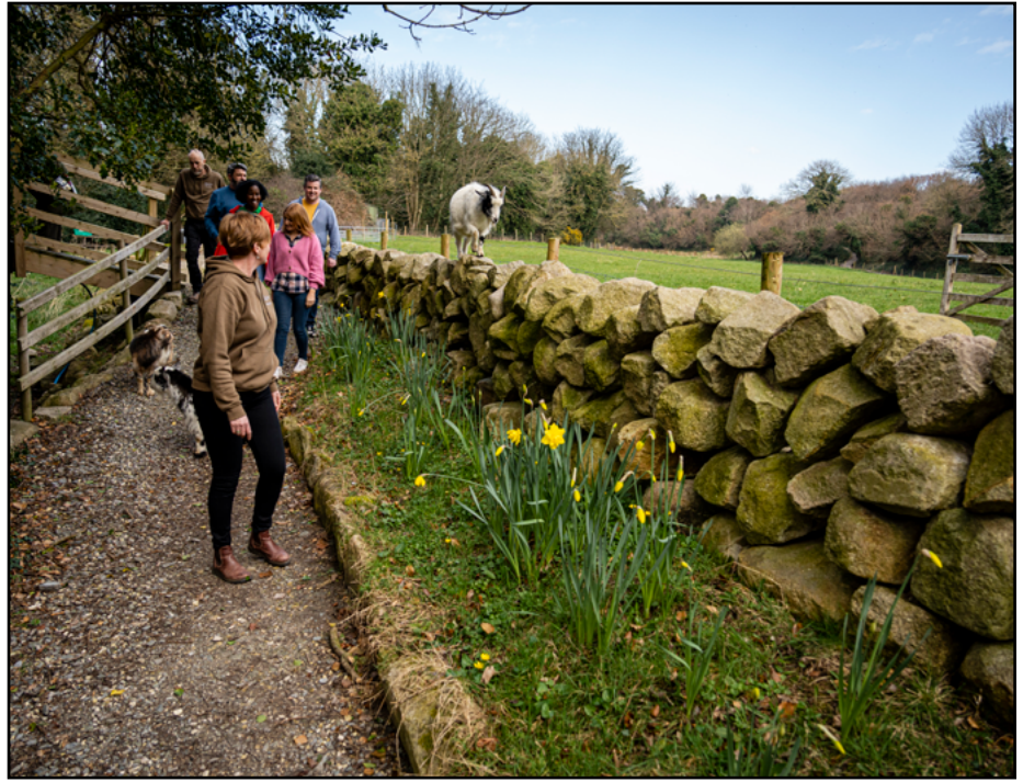
Dry Stone Wall Building Experience, The Mournes.

The walls' apparent simplicity belies their ingenuity; dry stone walls are handmade without any mortar or concrete and so their construction requires great skill and attention to detail - with each stone carefully measured, cut, and prepared to ensure stability.