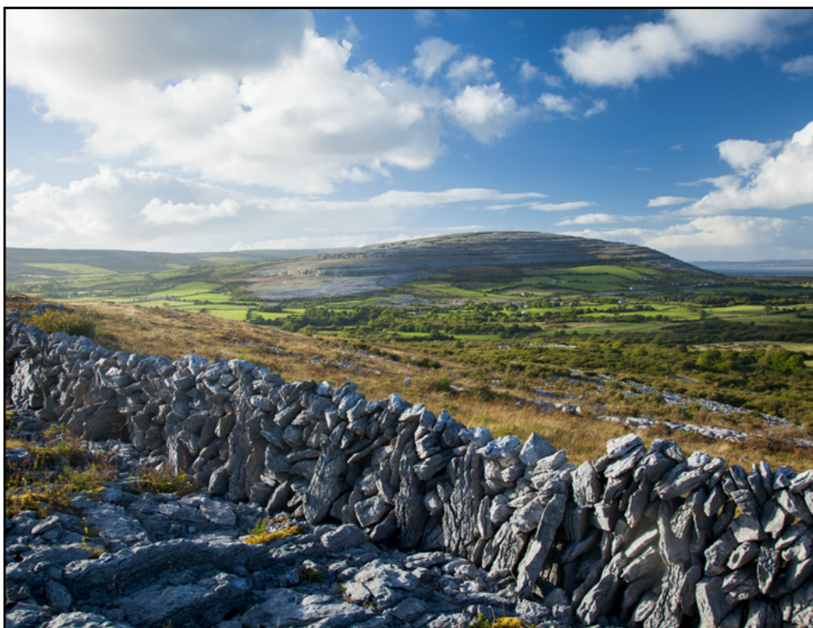
The Burren, County Clare.