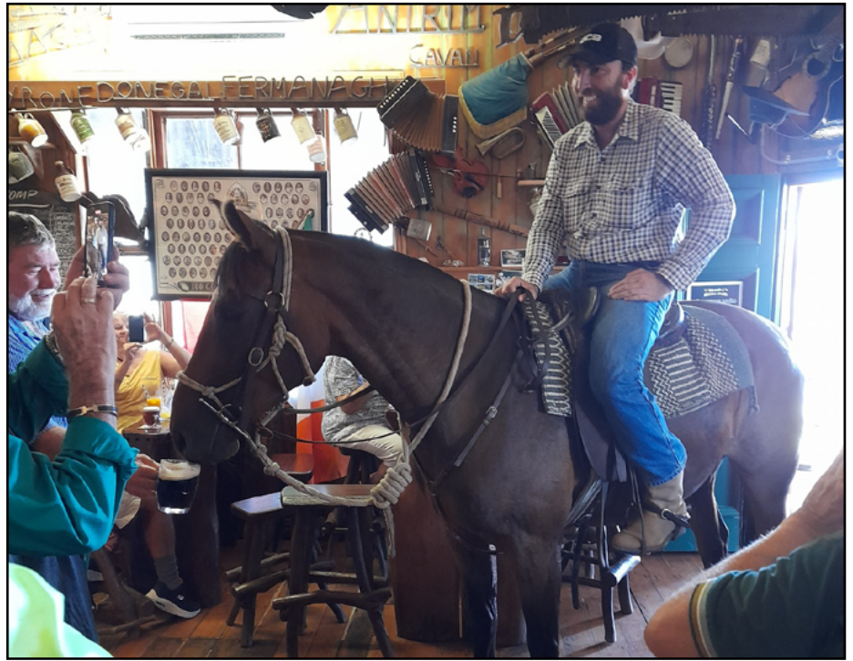
Finnegans Wake at O’Shanley’s Irish Pub.

The highlight of the day is the procession through Clifton’s main street, led by none other than Finnegan himself, lounging in his coffin, pint in hand. He’s joined by a colourful cast of characters, including Saint Patrick, the Pope, bishops, priests, nuns, pipers, and, of course, the tearful