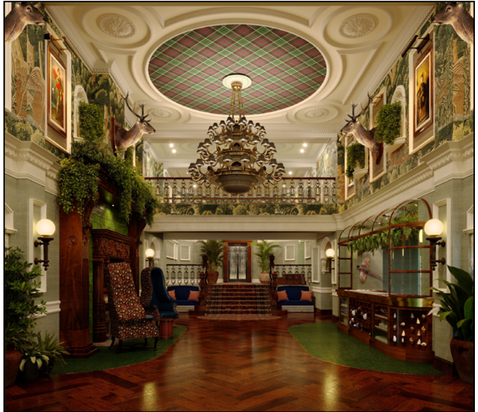
Slieve Donard Hotel, Newcastle, Co. Down.

Sitting by the shores of Lough Corrib, magnificent five-star Ashford Castle is the pinnacle of luxury with richly decorated rooms, and award-winning restaurants and spa. At Christmas, the lush decorations add to the castle's fairytale charm. A special three-day Christmas package (24–27 December) includes Christmas Eve dinner, a Christmas morning cruise with traditional music and hot whiskies, wine and gin tasting in the afternoon, festive movies in the cinema and the finest seasonal food served for lunches and dinners throughout. Seasonal entertainment and the chance to try outdoor expe-