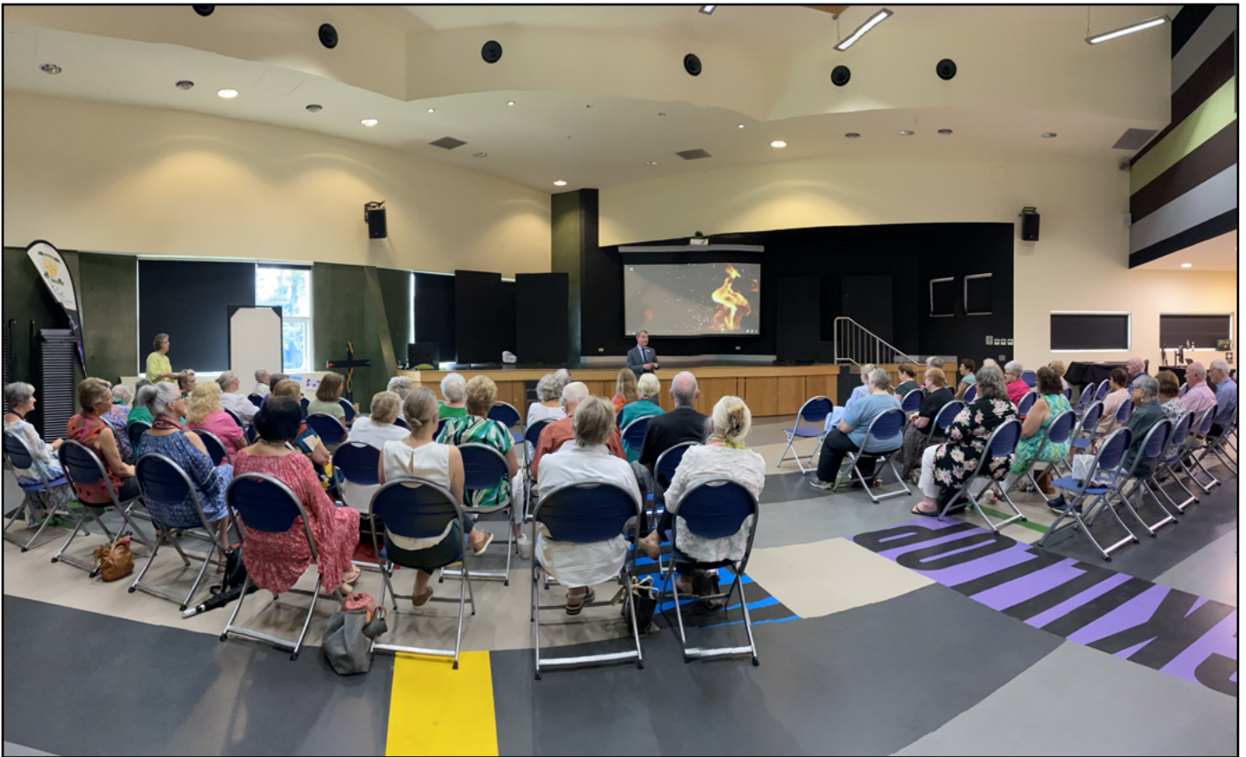
Queensland Irish Association's Saint Brigid's celebration screening in 2024.

Queensland Irish Association is set to screen Waving Goodbye to Dinosaurs documentary as part of our 2025 Saint Brigid Celebration.