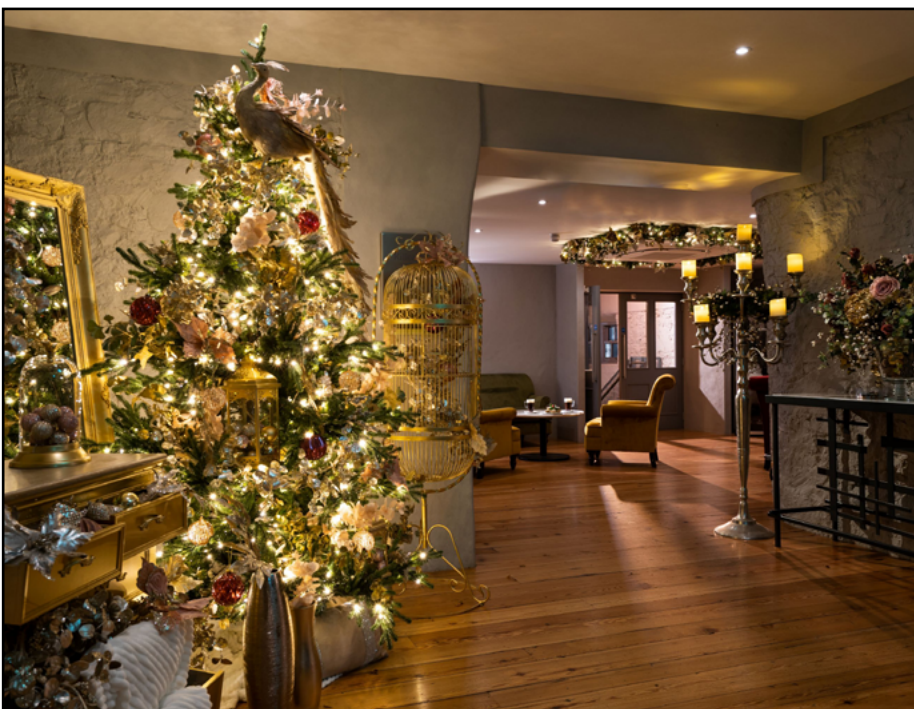
Killeavy Castle Estate, Killeavy, Co. Armagh.

Dating from 1614, this charming boutique hotel is the perfect place to spend an old-fashioned Christmas. Old world charm combines with modern-day luxury essentials to create a haven which is firmly rooted in sustainable practices and has achieved a Green Tourism Silver award. The hotel is offering A Merry Little Christmas Package that includes Christmas cocktails and canapes on Christmas Eve, a Christmas morning champagne breakfast and hearty traditional fare for lunch. Enjoy carols around the Christmas tree while sipping mulled wine and luxuriate in the Treetop Spa with forest views. For the bravehearted there is also the option of a Christmas Day sea swim at nearby Helen's Bay beach.