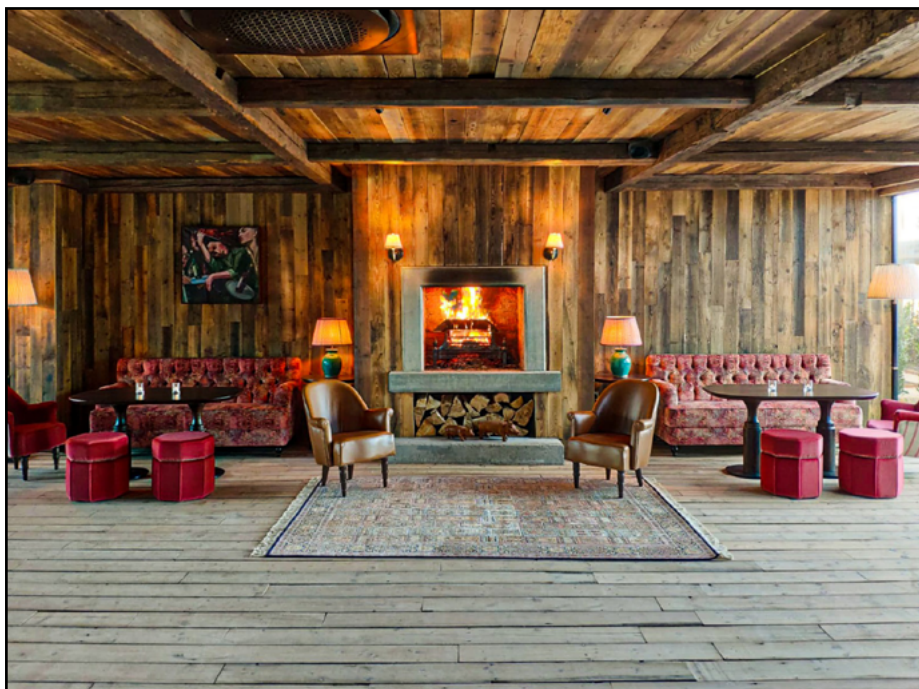
Lobby, Glasson Lakehouse, Glasson, Co. Westmeath.