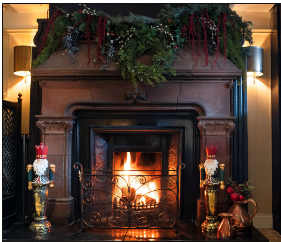
The Old Inn, Boutique Hotel, Crawfordsburn, Co. Down.